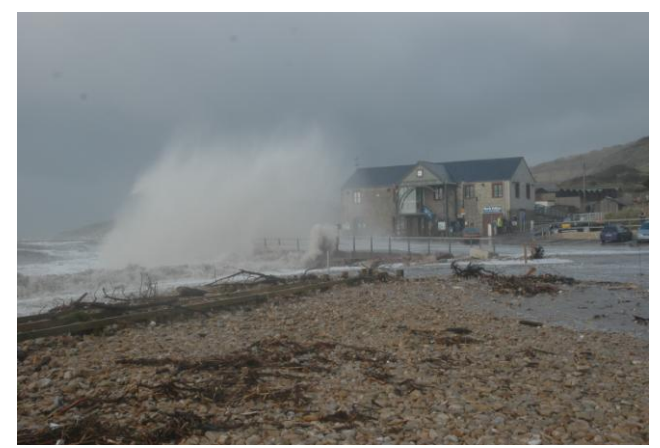
Charmouth Heritage Centre in Storm.

Shifting species range boundaries will have implications for Marine Protected Areas as designated boundaries in the past have been static. The Marine Conservation Zone (MCZ) Project Ecological Network Guidance states "Where features protected by MCZs have altered due to natural processes or climate change, it will be possible to revise the features listed for a site, de-designate MCZs, amend the MCZ conservation objectives, or modify the boundaries if such actions are deemed appropriate..."