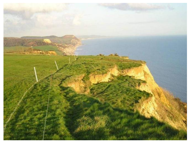
Coastal erosion at Timber Hill.

There is now a growing presumption that for the open coast, 'No Active Intervention' will be the preferred policy so that natural erosional processes are allowed to progress unhindered; unless there is an overriding social or economic reason to intervene.